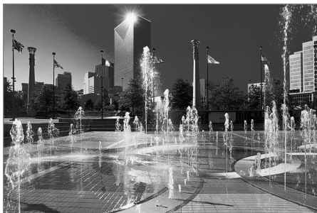
Atlanta's Centennial Olympic Park, destination of a Thursday afternoon or Friday morning special APM bus.