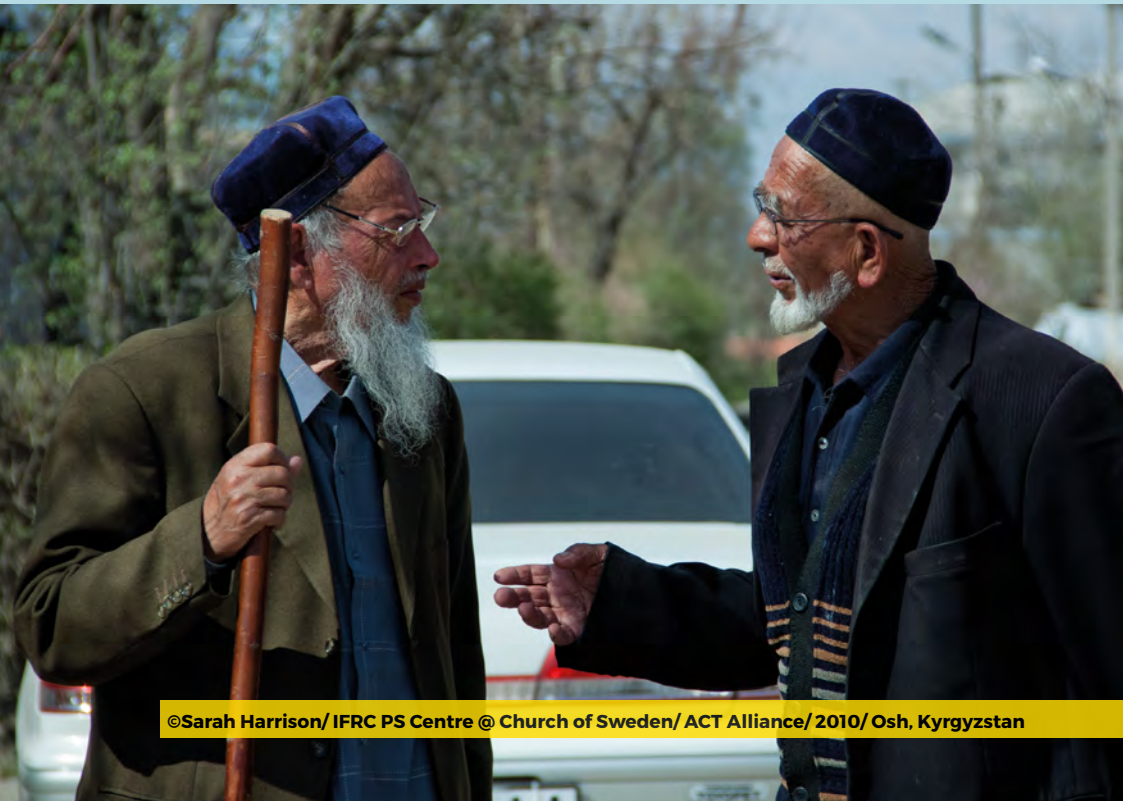
©Sarah Harrison/ IFRC PS Centre @ Church of Sweden/ ACT Alliance/ 2010/ Osh, Kyrgyzstan

During quarantine, where possible, safe communication channels should be provided to reduce loneliness and psychological isolation (e.g. WeChat).